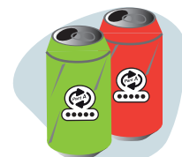
Dåser med pant