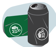
Dåser uden pant