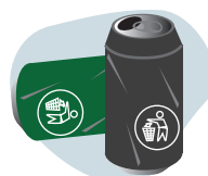
Dåser uden pant