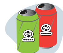
Dåser med pant